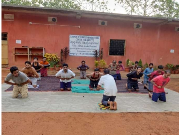
Regular Yoga Programme