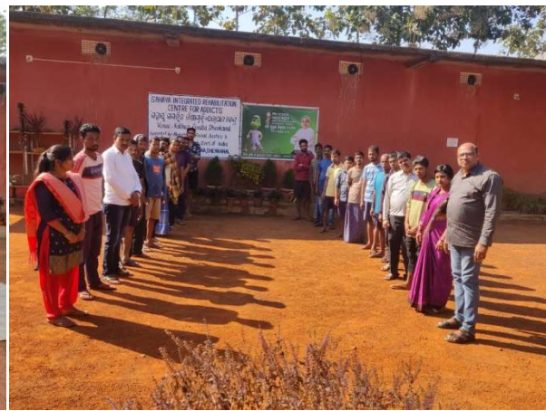
All inmates & Staffs of IRCA