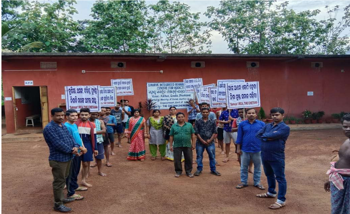
Observation of International Day against Drug-Abuse and Illicit Trafficking on 26 th June 2022

Below we submit few service related photographs;