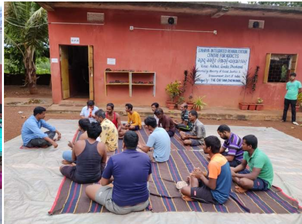
Bhajan & Kirtan after Yoga session